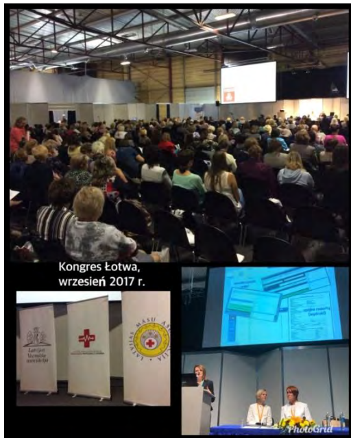
Kongres Łódź, wrzesień 2017 r.

In 2017, a few non-serial publications and articles on implementing the ICNP Classification into practice came out in scientific journals. We recommend some of them: